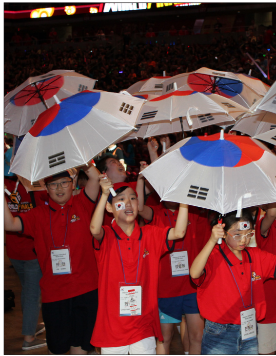
South Korea Team, 2016 Opening Ceremonies