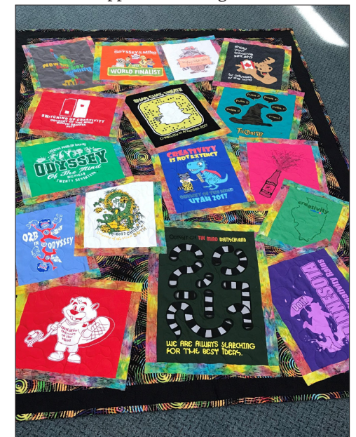
2018 COU Quilt

Visit the website for more information at www.creativeopportunities.org .