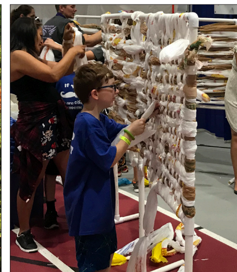
Plarn Mats at the Creativity Festival