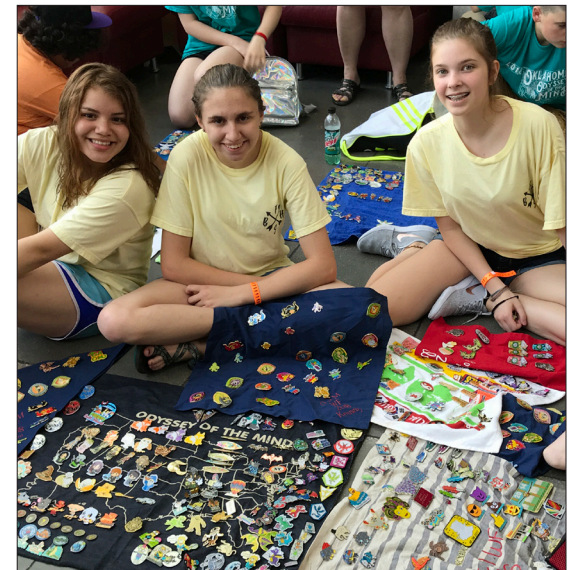
Flowery Branch Georgia Pin Trading