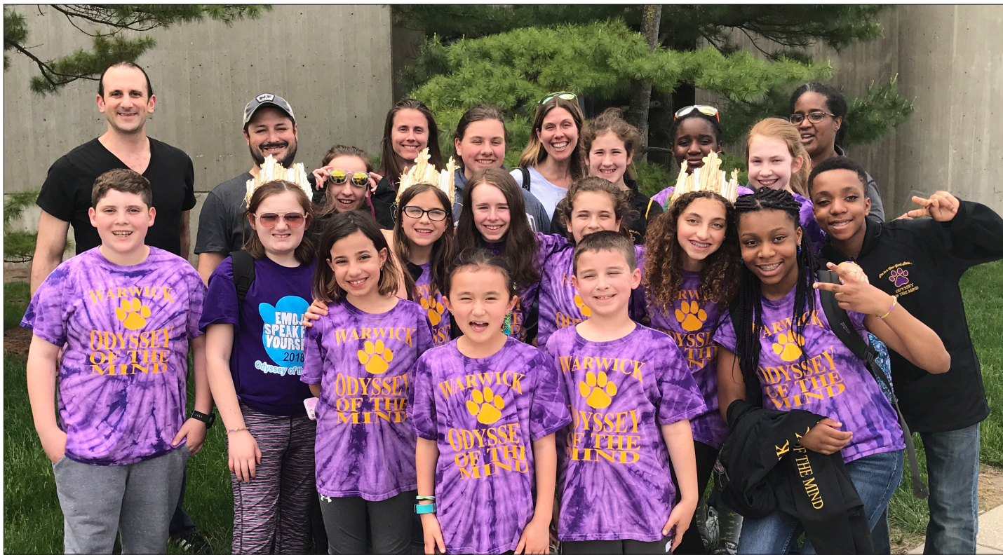
2018 Odyssey of the Mind Team from Warwick, New York

FACEBOOK: www.facebook.com/OdysseyHQ • TWITTER: @OdysseyHQ • HASHTAG: #odysseywf