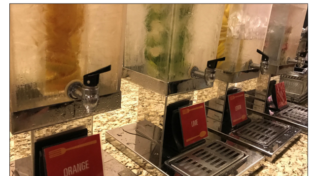
Flavored water dispensers at Seasons Marketplace

3: Get sleep. Adequate sleep will not only help you feel well rested and prepared for your day, but will also help you think more clearly. Try to sleep 8 hours a night.