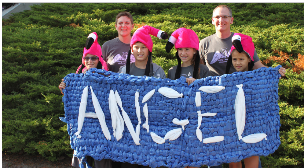
2018 Odyssey Angels