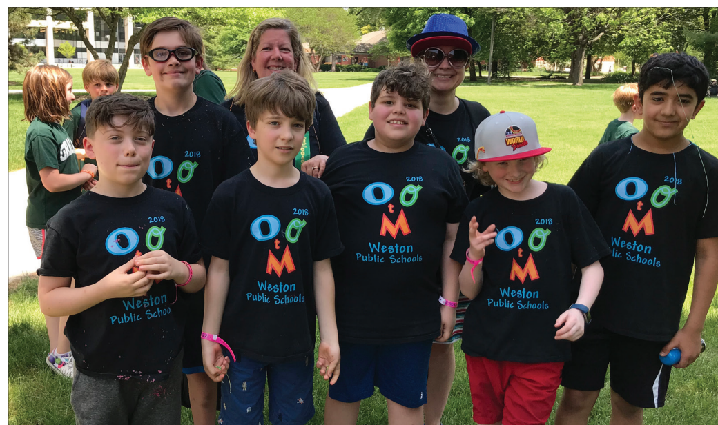
The Connecticut team after Spontaneous

PHOTO BY BRI GERKE/AMES CONVENTION &amp; VISITORS BUREAU