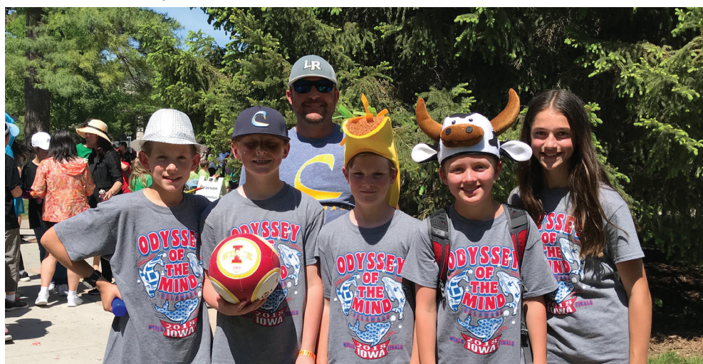
Delaware Team at Spontaneous

PHOTO BY NICOLE ONKEN/AMES CONVENTION &amp; VISITORS BUREAU