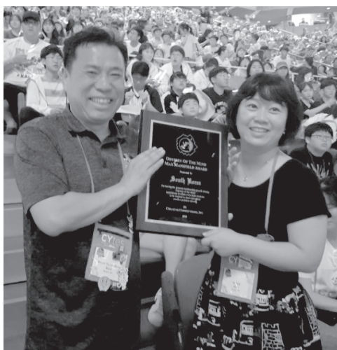
South Korea was also awarded the Max Mansfield Award at 2018 WF.