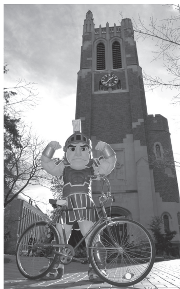
MSU Bikes offers rentals during World Finals.

make a stop (or two) at one of the famed MSU Dairy Store locations for a taste of the brand-new WF ice cream flavor! Odyssey 40th Anniversary Mash is sugar cookie ice cream with red frosting swirl and cookie dough pieces. Grab a scoop (or two) of this flavor and more, available at both locations: