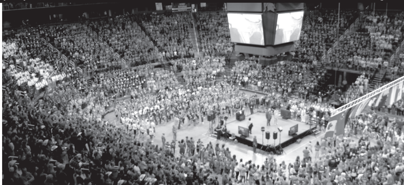
The Breslin Center was packed last night with enough energy and creativity to power a whole city. Good luck to all those participating in this year's World Finals competition!