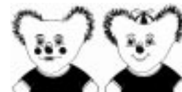
Cookie & Milkweed

NOTE: These problems are tentative as of May 2000. While some aspects may change, the nature of the problems will remain the same. All problems have an 8-minute time limit. Cost limits are in U.S. dollars.